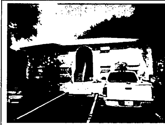
Uniform Wind Mitigation Inspection Pictures 203 S.Orchard Street BLDG 11 Ormond Beach, FL