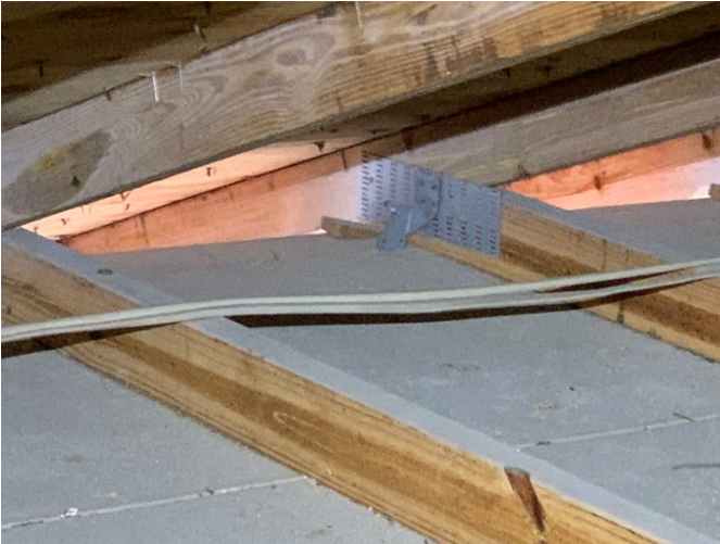
Clips to roof attachments used with 3 nails and attached to topplate