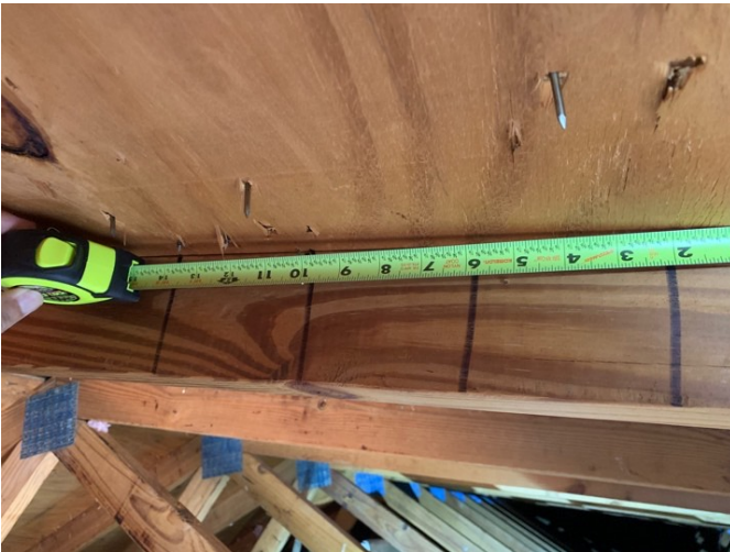
8 penny nails spaced at 6" or less in the field