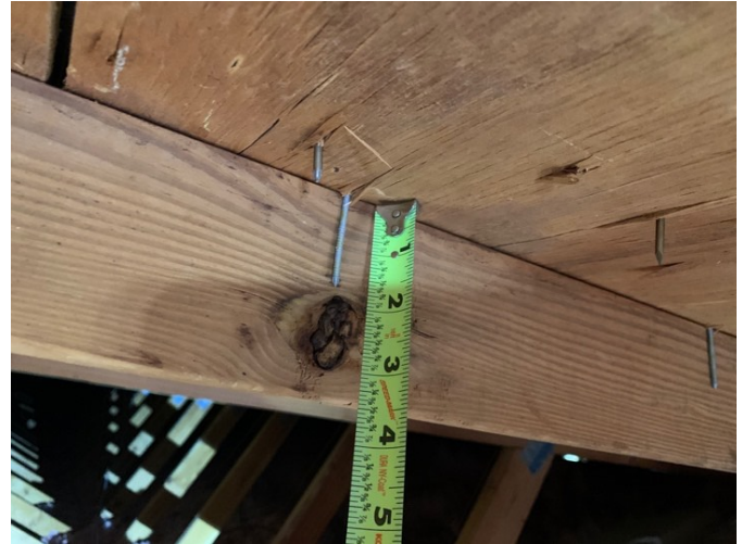
2 1/2 inch nails through 7/16 inch sheeting