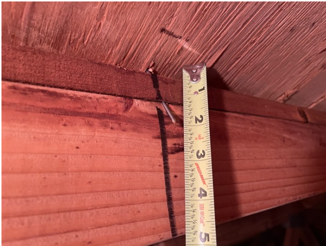
2 1/2 inch nails through 7/16 inch sheeting