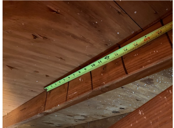
8 penny nails spaced at 6" or less in the field