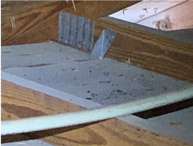
Clips to roof attachments used with 3 nails and attached to topplate