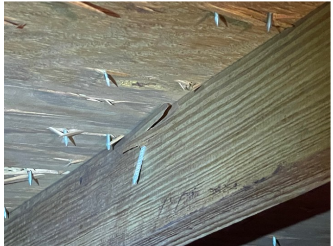
2 1/2 inch nails through 7/16 inch sheeting