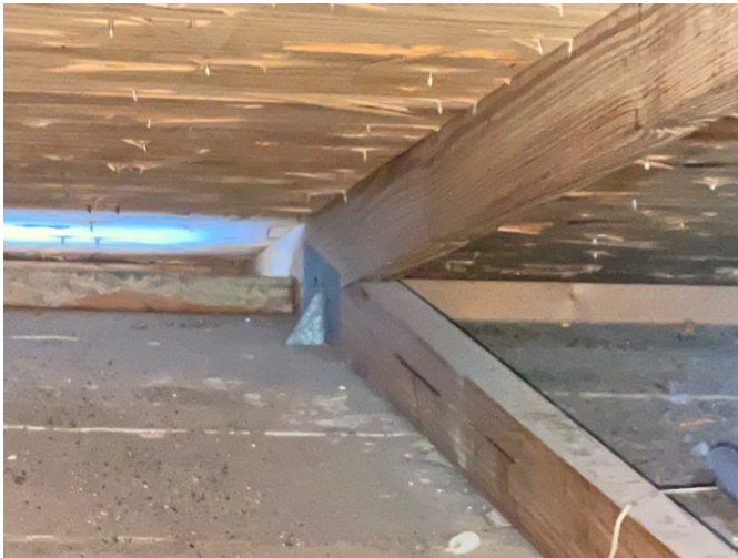
Clips to roof attachments used with 3 nails and attached to topplate