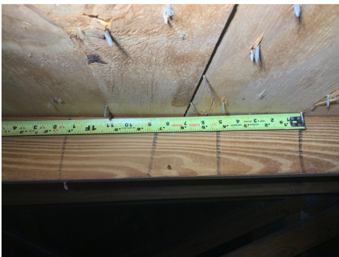
8 penny nails spaced at 6" or less in the field