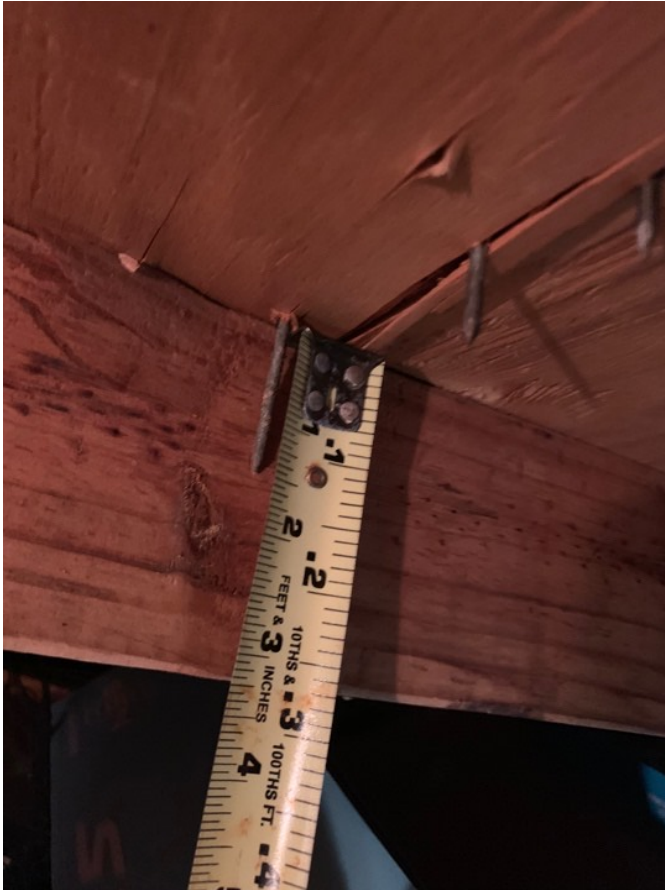
2 1/2 inch nails through 7/16 inch sheeting