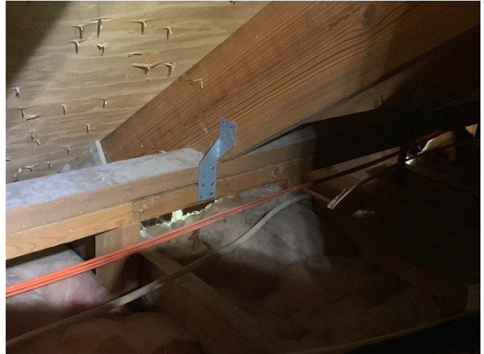
Clips to roof attachments used with 3 nails and attached to topplate