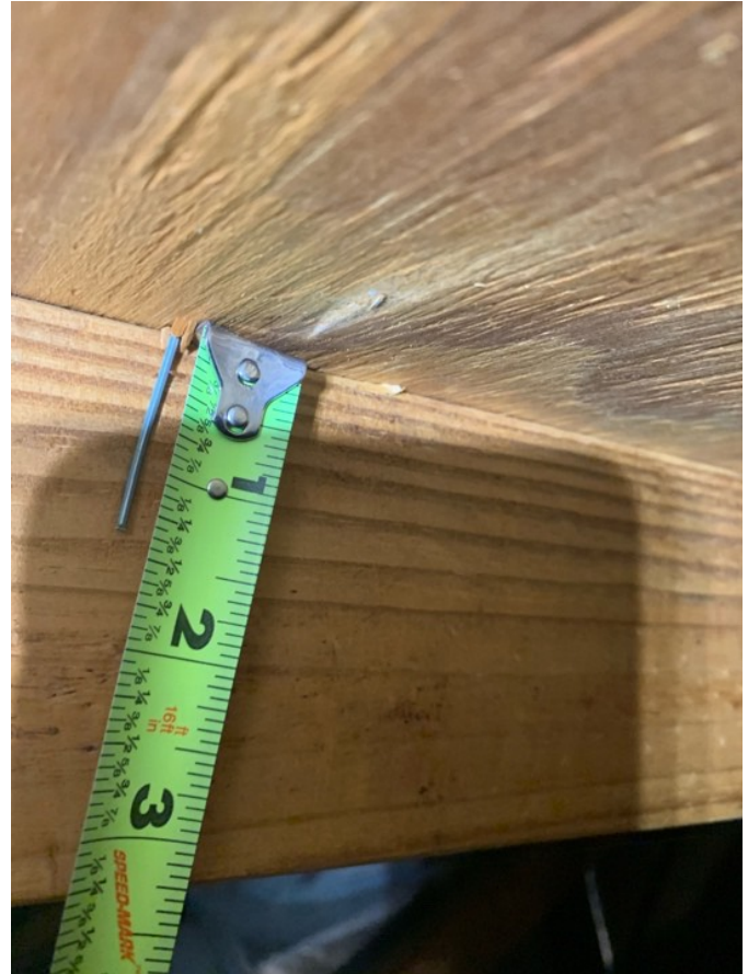
2 1/2 inch nails through 7/16 inch sheeting