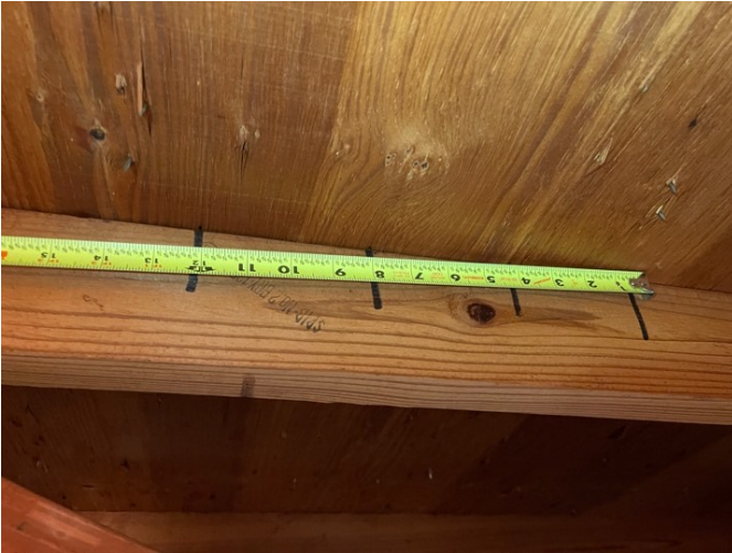
8 penny nails spaced at 6" or less in the field