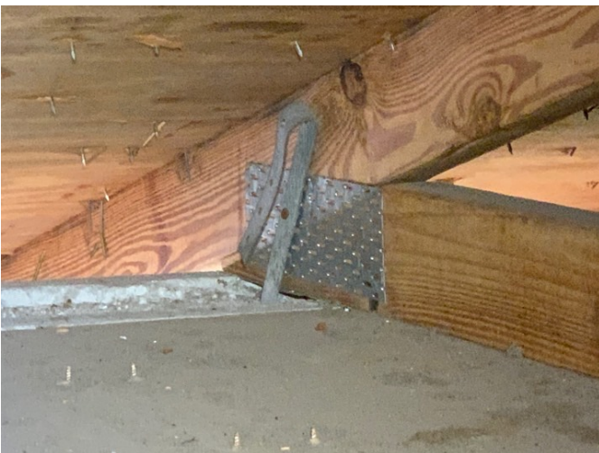
Clips to roof attachments used with 3 nails and attached to topplate